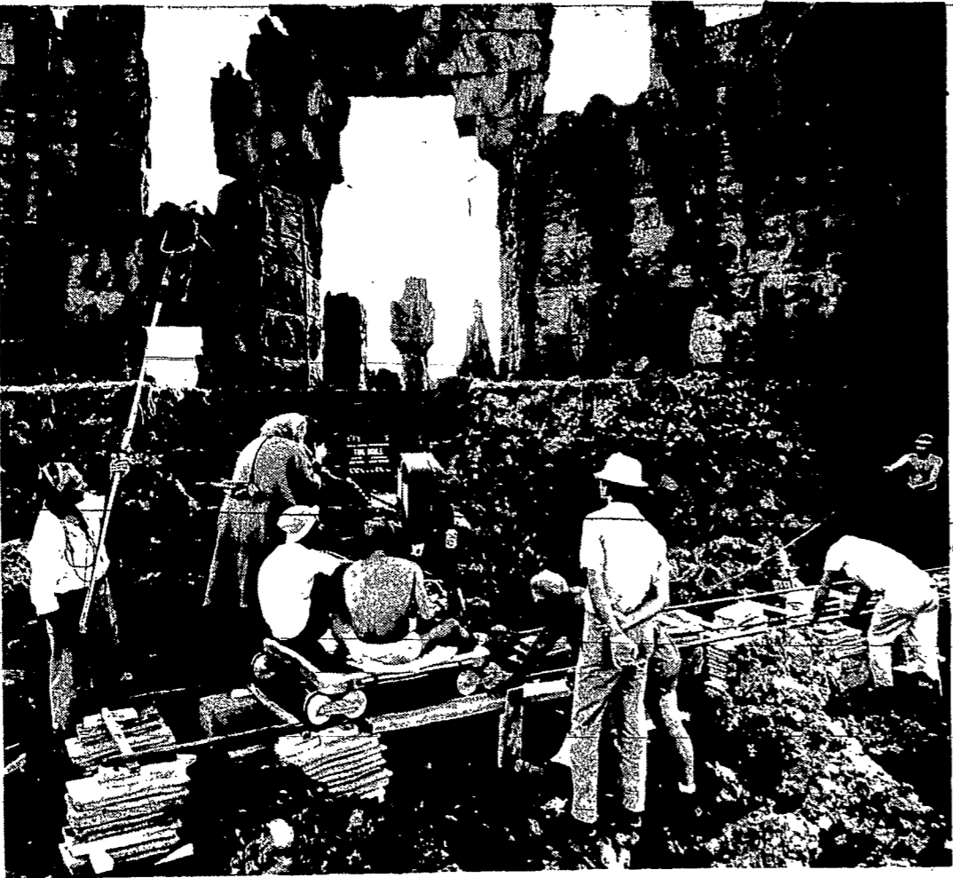
Shooting "The Bible."

The difference between an old-style Biblical film, with emphasis on scenery and the traditional "cast of thousands" and the newer-type religious film with emphasis on character is seen in comparing George