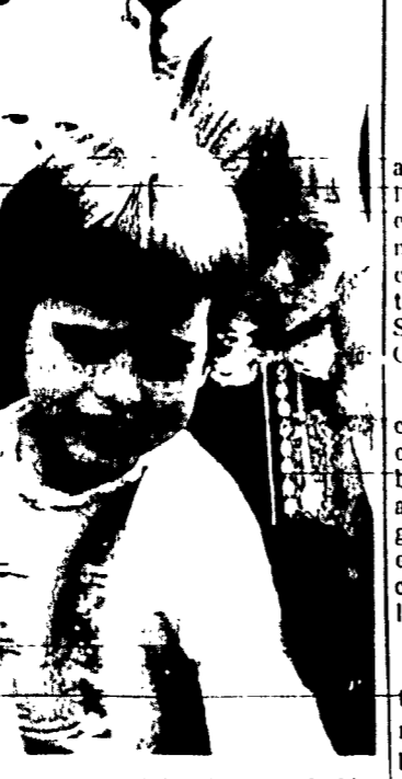
A story with pictures holds attention of youngsters.