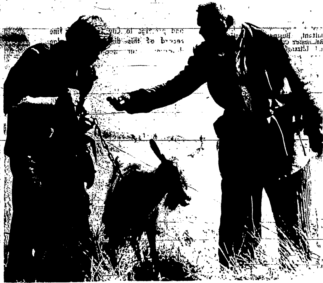
A scene from "The Fat and the Lean," an offering in the New Cinema program scheduled for Nazareth College.

and his "Goon Show" troupe in The Running, Jumping, and Standing Still Film, and The Fat and The Lean by Roman Polanski.