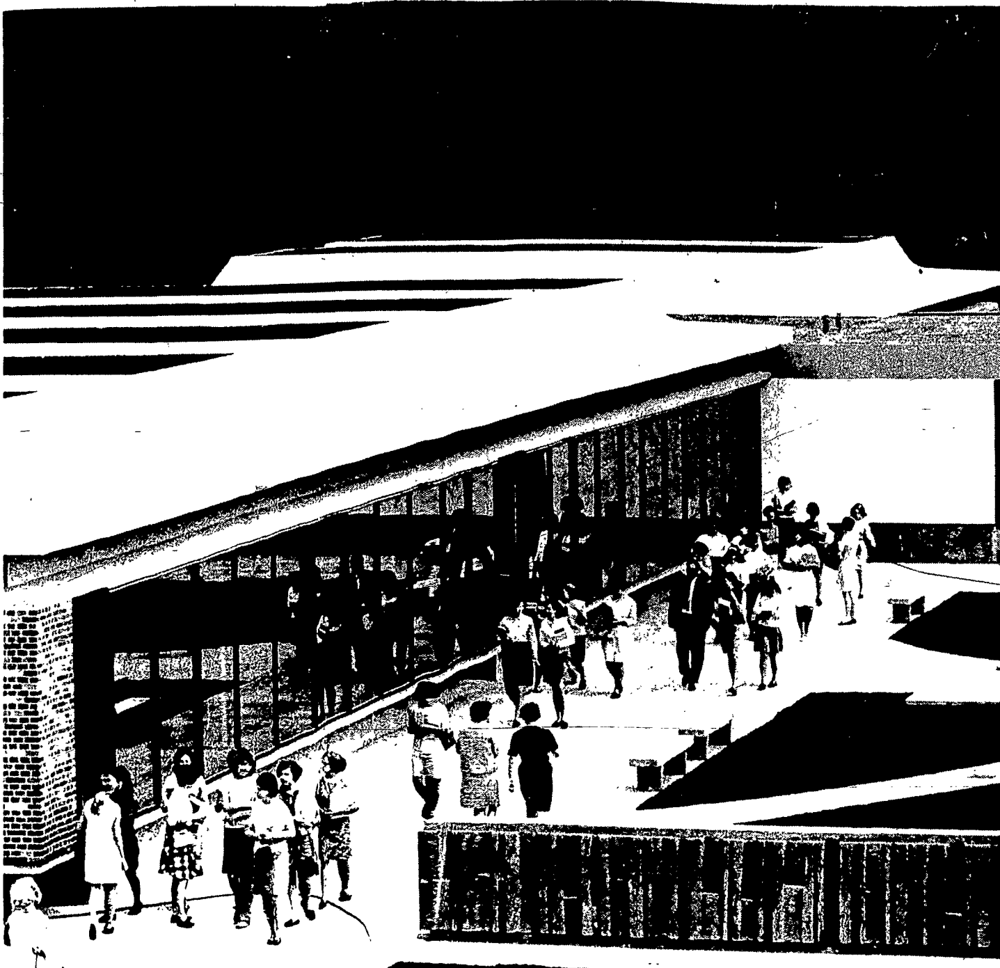
A modern cloister fills with students and teachers between classes.