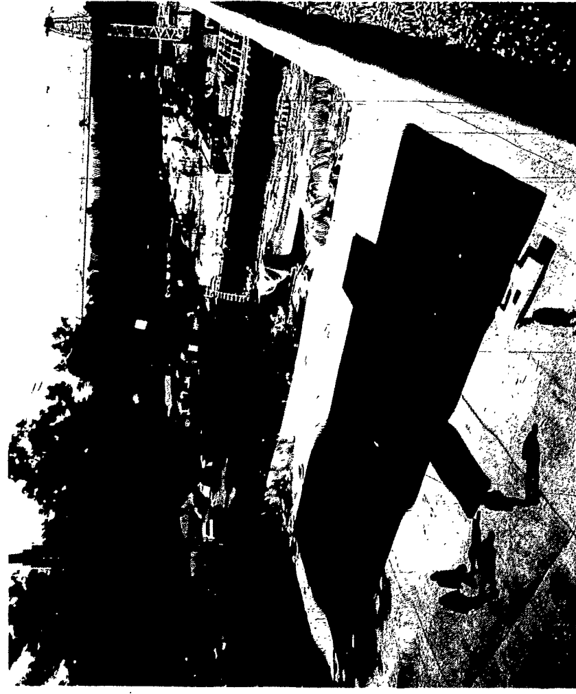
New Science Building goes up rapidly, assisted by a Swedish-made climbing crane above. Crane is dismantled and taken down after top story is finished. View at right from roof of adjoining St. Basil Hall shows new science building in relation to Administration Building.