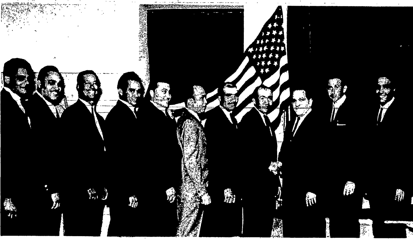
Knights Top 100 Mark