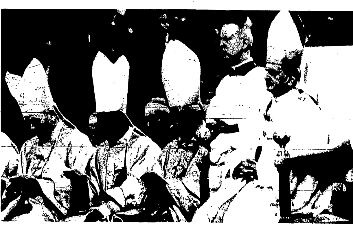
Pope Paul, still alling from an intestinal infection, presided at Mass opening first-of-itskind Synod of Bishops now meeting in Rome.