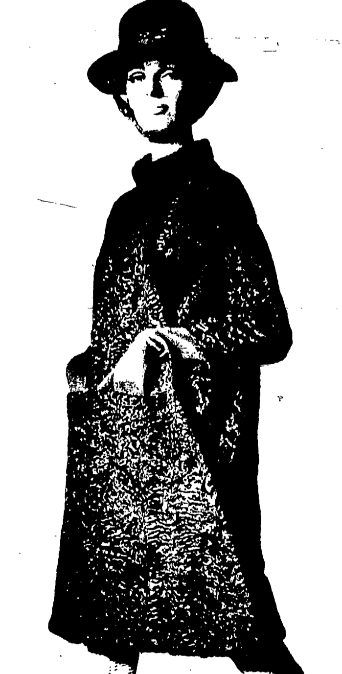
Oriental in inspiration, Victor Herz' La Sur brown-dyed greatcoat, has a narrow Mandarin collar and a curved side closing that swings widely to the hem. Pockets are little Kangaroo pouches center front.