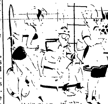
"Guess who's gonna cut the ribbon to open the new Tri-State Highway?"