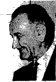
President Johnson Boomerang

WASHINGTON—President Johnson's request for a tax increase has been a long time in coming. And when it did come, it surprised most observers by its larger-than-expected size. For many months the government let it be known that a 6 per cent surcharge was being considered on both individual and company tax payments. While the President hinted a few weeks ago that a higher figure might be proposed, the guessing had been a maximum of 8 per cent, and not the 10 per cent ultimately requested. Further, there were many in Washington who, knowing Johnson's predilection for managing the impact of his announcements, suspected that the hint of higher taxes was simply a ploy to make his request seem modest when made. He has resorted to this kind of thing before.