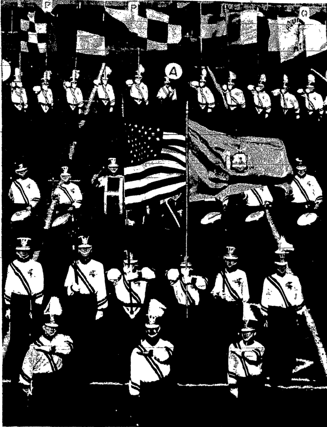
READY TO GO! Aquinas Institute's crack Color Guard snaps to attention in final practice before heading for Boston, where they will participate in the American Legion parade on Aug. 28.

Other Rochester units expected to take part in the Legion convention are the Crusaders Drum Corps and the Emerald Statesmen Junior Drum Corps.