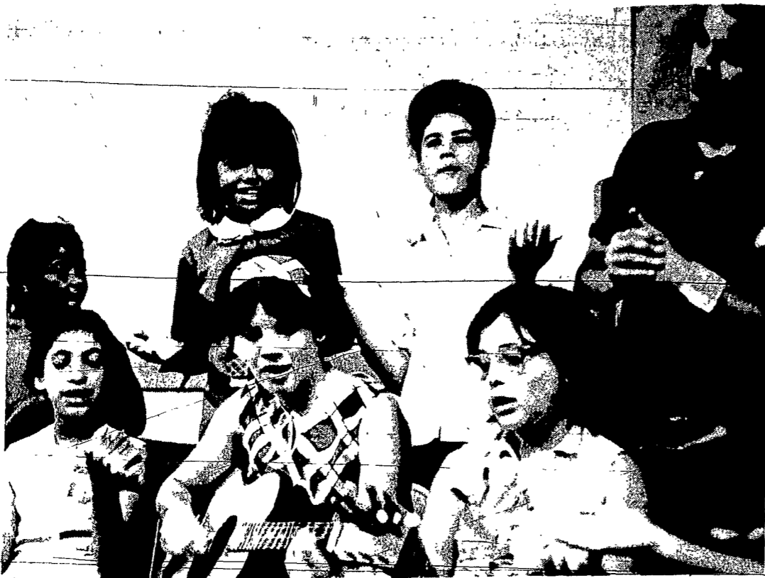
Teenagers at St. Patrick's Church sing Kumbaya song which includes gestures pointing to eyes, heart, openness to world.