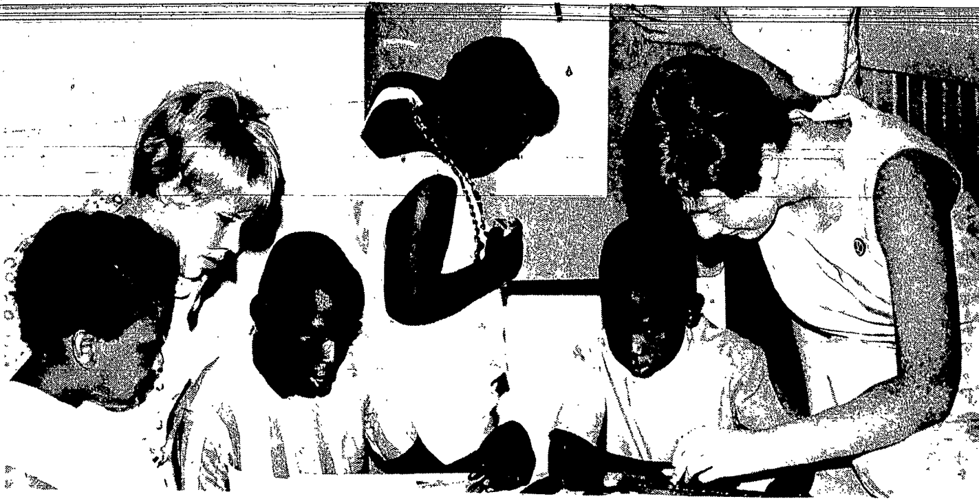
SUMMER VOLUNTEERS in the ESSP venture work at several social agencies. The two older girls in the picture are working with children of the Neighborhood Day Camp.