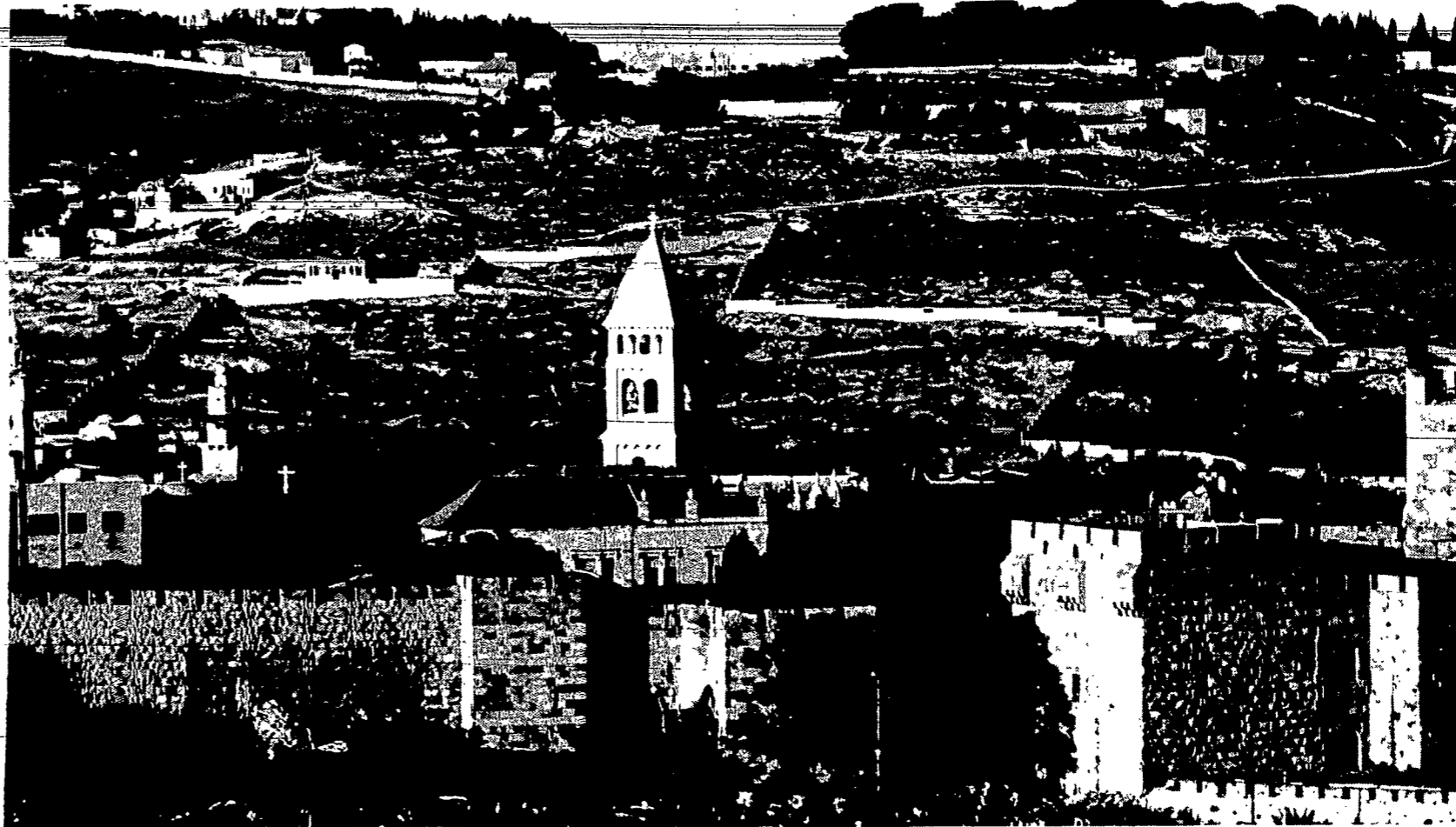
Shadows of sunset creep up the ancient walls of Jerusalem, July 1, first Sabbath barriers of twenty years came down between Arab and Jewish sections of city. Throngs of Israelis leave through Jaffa Gate after visiting "wailing wall" at site where Solomon's Temple once stood. Minarets of mosques and church towers indicate city is also sacred to Christians and Moslems. Mount of Olives rises in background.