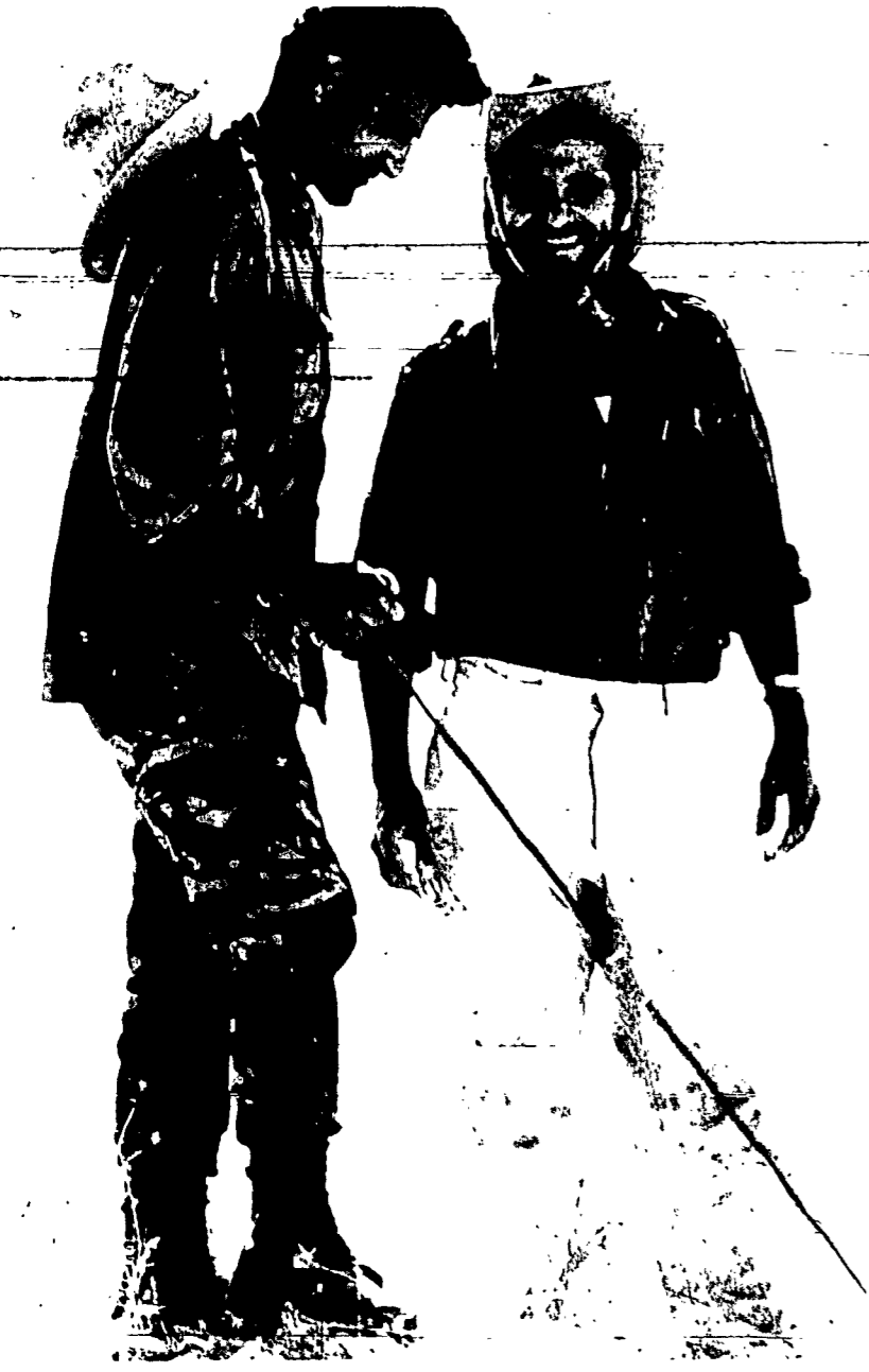
Two Israeli soldiers probe for mines in former no-man's land between Jordan and Israel near Bethlehem.