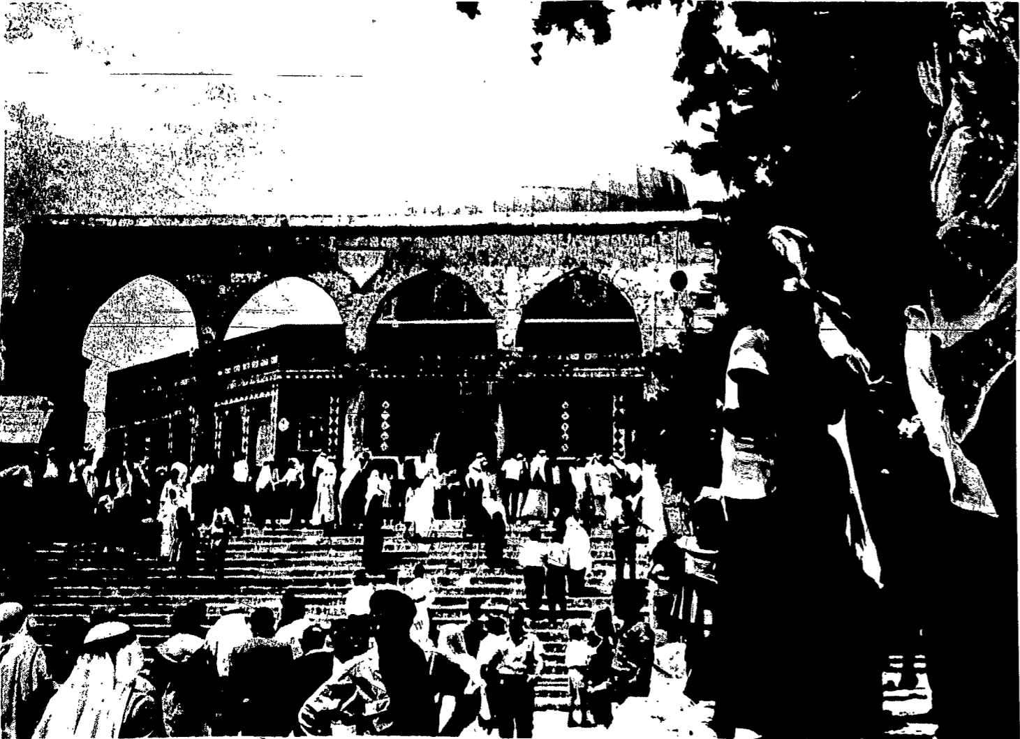
Moslems by the thousands filled the vast courtyard of Mosque of Omar in Jerusalem on Friday, June 30, two days after Israelis incorporated once-Jordan-held section of city into larger, newer Jewish section.