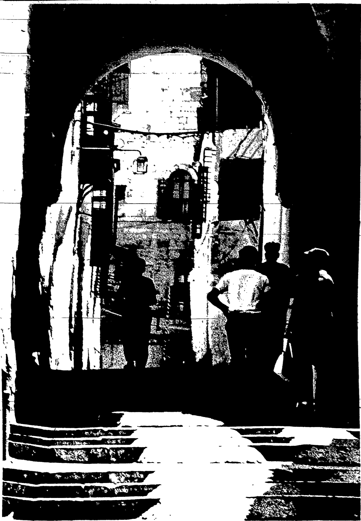
Life gets back to normal on quiet side street in Jerusalem within month of week-long Arab-Israeli war.