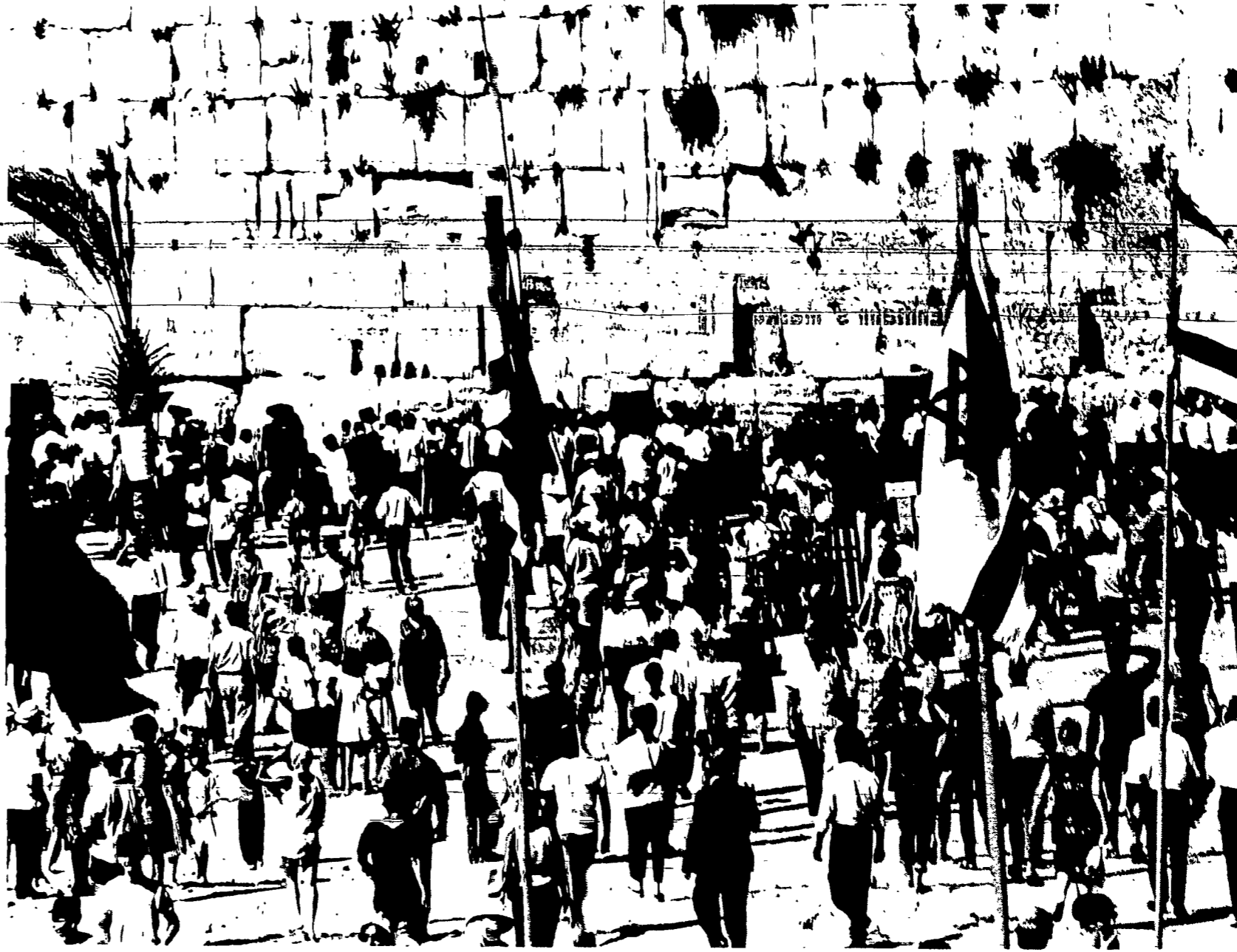
More than 20,000 Jews trooped to the "wailing wall" — only surviving remnant of their ancient Temple at Jerusalem — on first Sabbath in twenty years Jews were admitted to area. Throngs included rigid Hasidim as also many who consider "the wall" more an historic national monument.