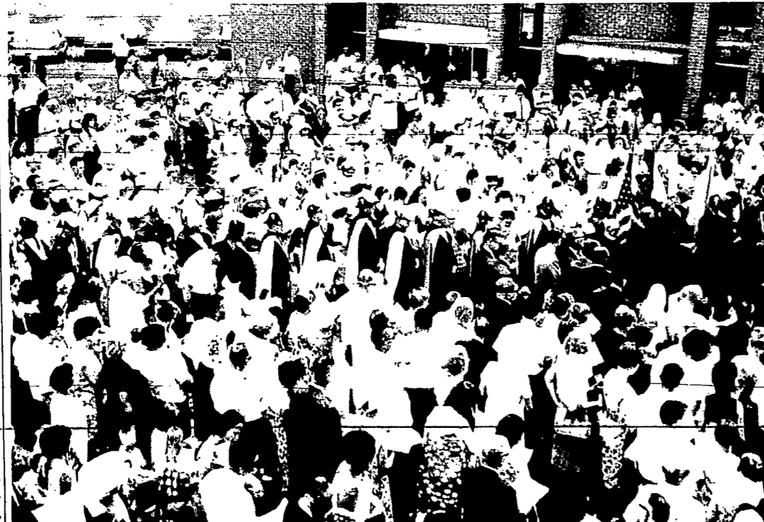
Some of the hundreds at Sunday's dedication Mass at Notre Dame Retreat House near Canandaigua.