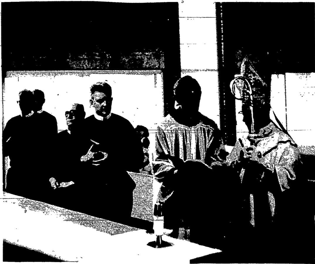
Bishop Sheen said Mass and gave the sermon at new Notre Dame Retreat House dedication rite.