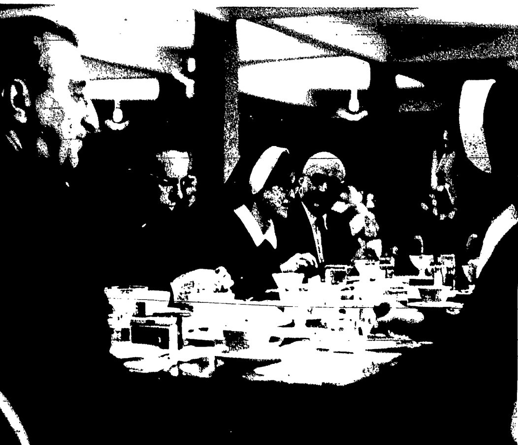
Young nuns help each other into new religious garb for reception rite at St. Joseph's Motherhouse. Parents and friends joined the nuns for luncheon