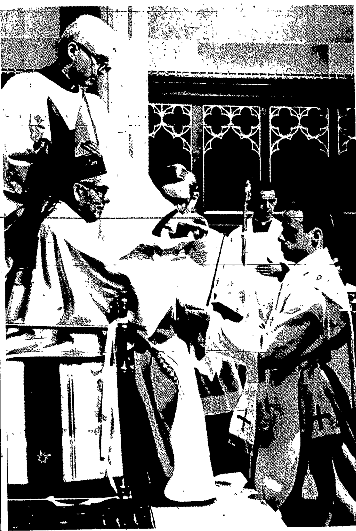
Bishop Sheen anoints hands of young priests at Cathedral rite last Saturday morning.