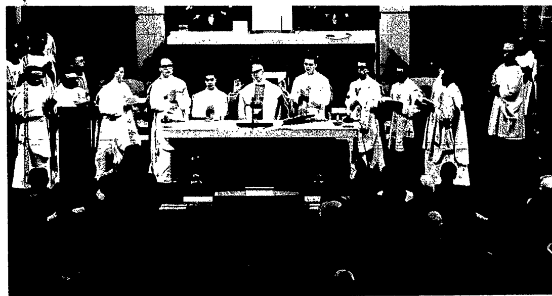
Bishop Sheen and ten new priests say Mass together at Cathedral altar.