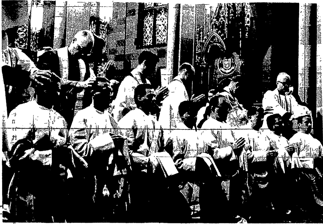
Priests place their hands on heads of young candidates during ordination ceremony at Cathedral. Ten young men were ordained.