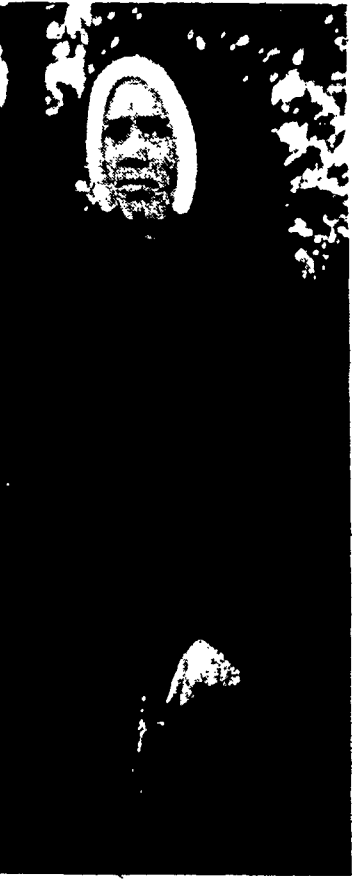
Only survivor of the 1917 apparitions is Sister Lucy, now a Carmelite nun. Other two children died in an epidemic soon after end of World War