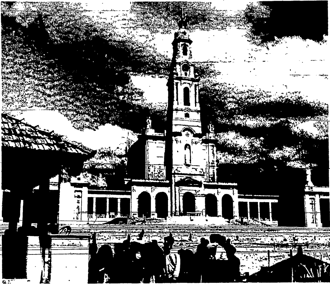
A massive shrine church stands near spot where 1917 apparitions of the Virgin took place. A small chapel, at left, stands on site where our Lady spoke to children.