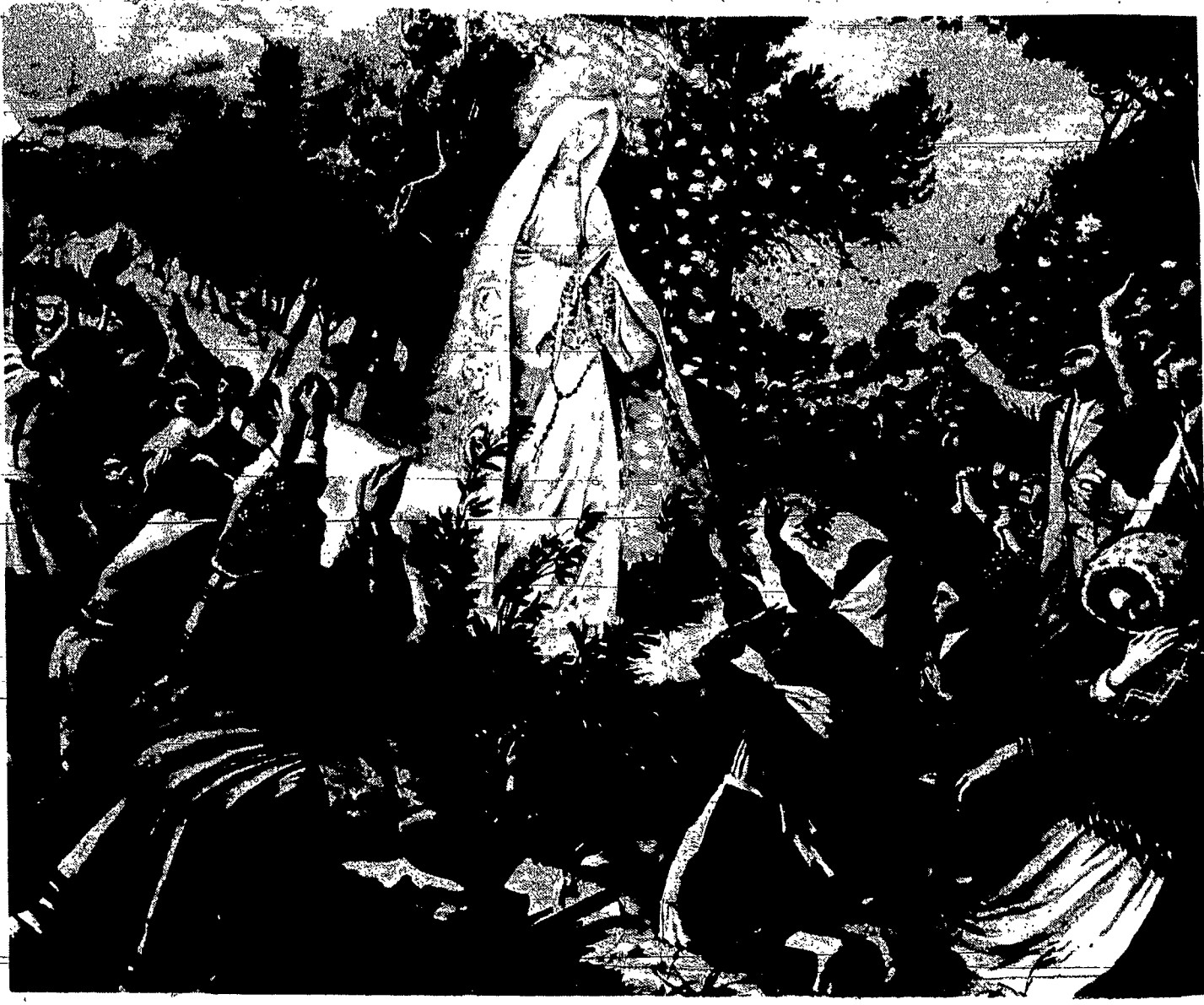
Pope Paul will be in Fatima, Portugal, tomorrow, Saturday, May 13, to say a Mass for peace at the spot where three shepherd children said they saw a series of apparitions of the Blessed Virgin Mary in 1917. First apparition was on May 13 di-