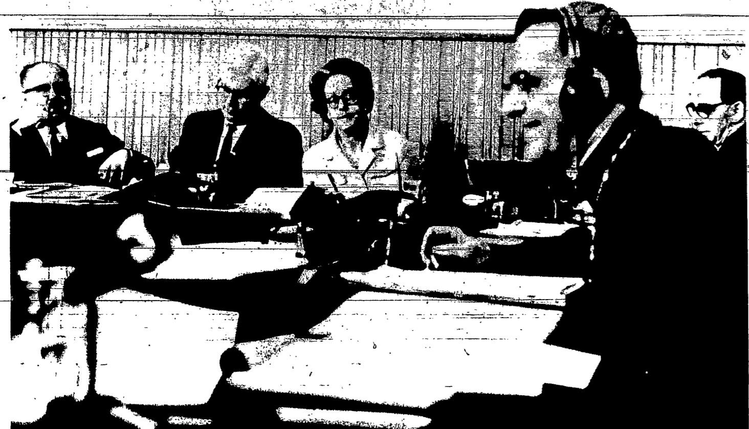
Peace Unit's First Meeting