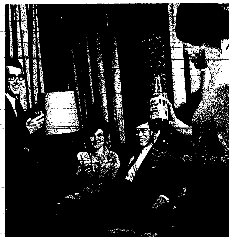
Old Friar Pink Cat is a Hit Anytime!

EGBERT F. Ashley Co. Insurance 300 FIRST FEDERAL SAVINGS BLDG., 328 E. MAIN ST., ROCHESTER, N.Y. 14604 PHONE (716) 544-2620