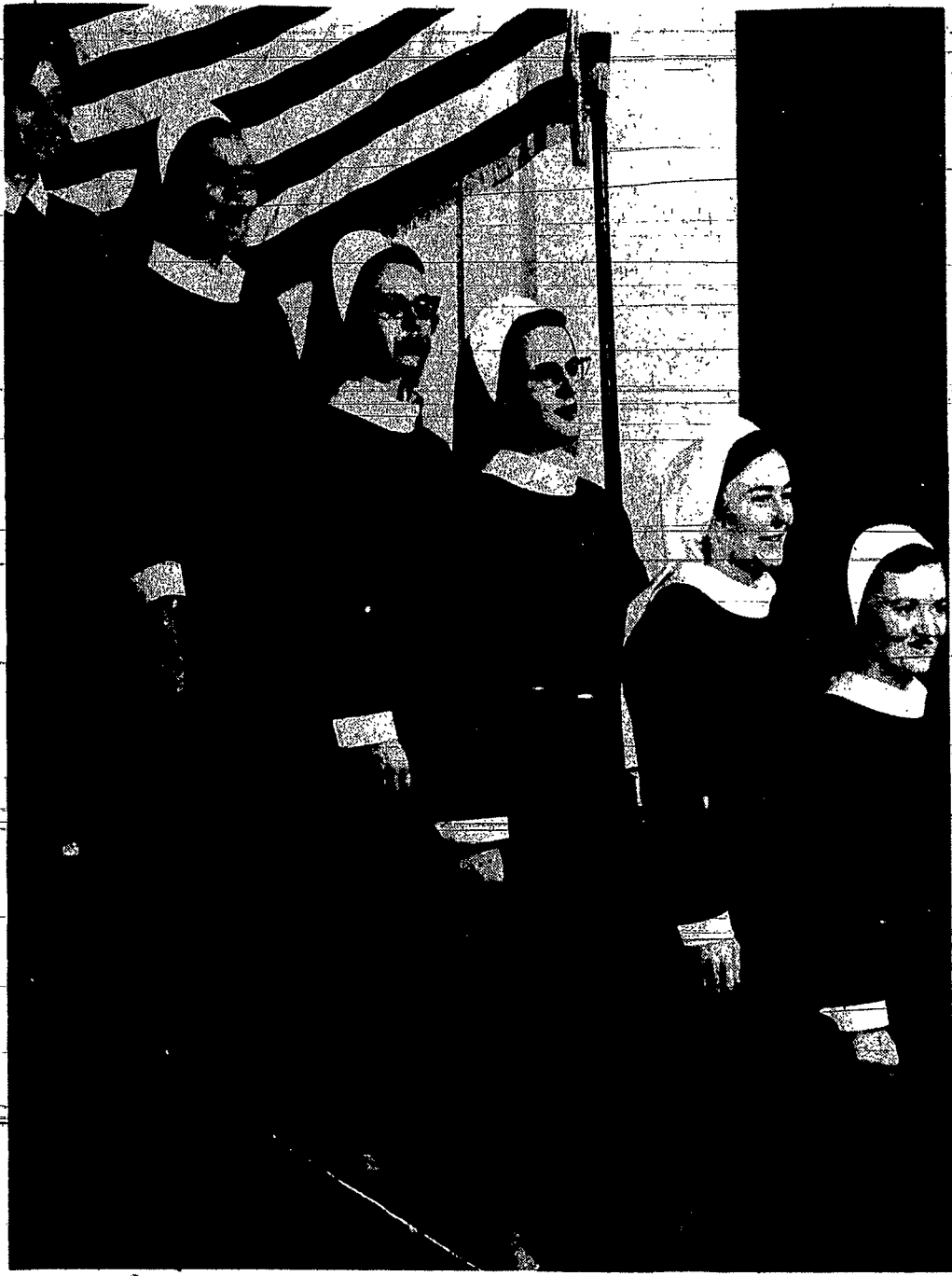
Chorus of 100 is made up of postulants, novices, junior professed and final professed Sisters from all apostolates of the Sisters of Mercy.