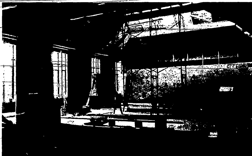
Wide angle lens gives complete perspective of interior of Becket Hall Chapel. Construction is in near stage of completion.