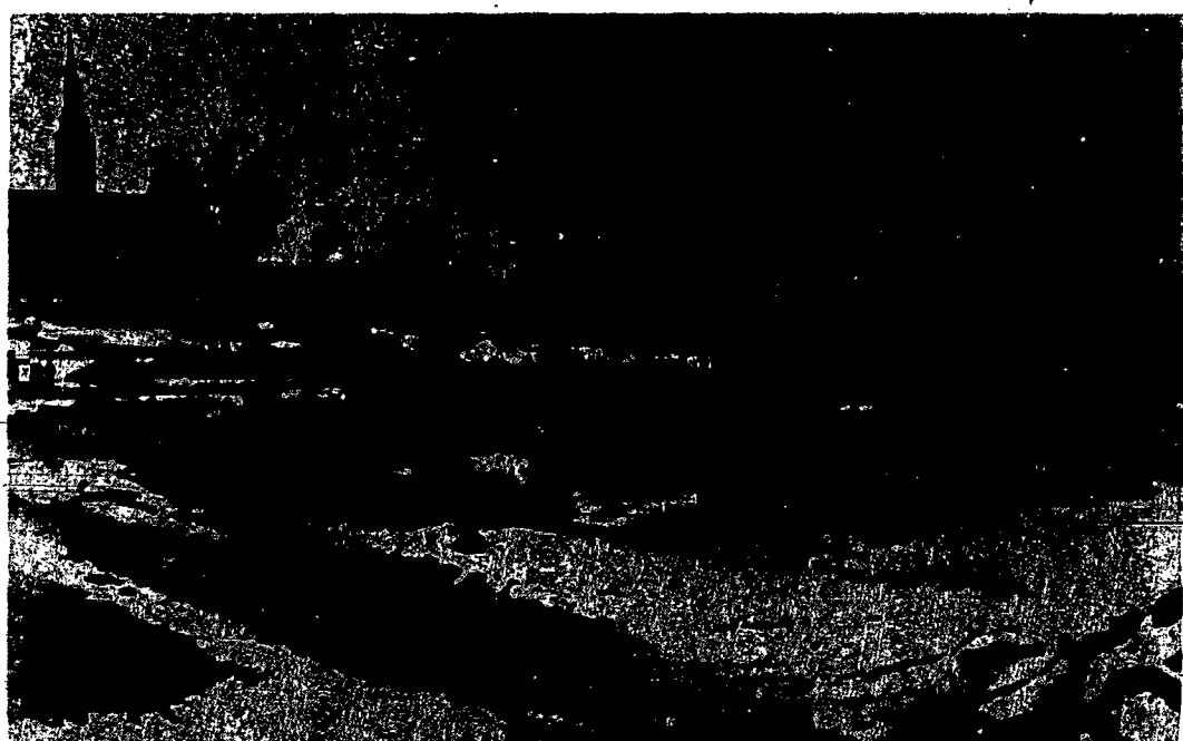
Footings and walls rise rapidly for new Science Building at St. John Fisher College. Administrative building is in left background.