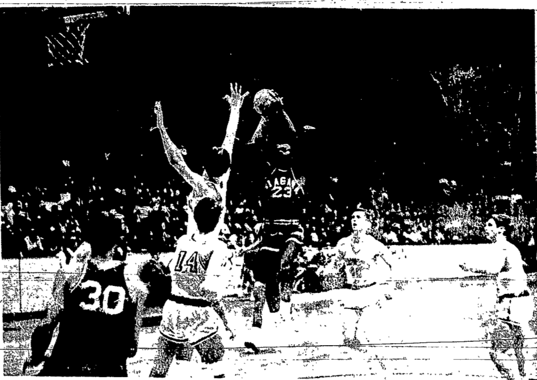
Niagara's noted Calvin Murphy goes airborne in game against Fisher Saturday night. Niagara won 93 to 79.