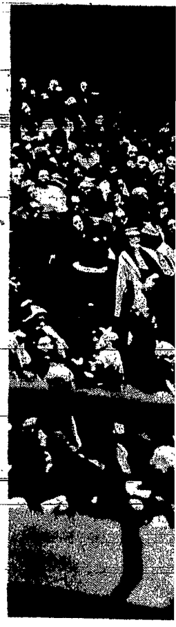
Three nuns at...

Special Prices Good Today Thru Wed. Nite, March 1st. QUANTITY RIGHTS RESERVED