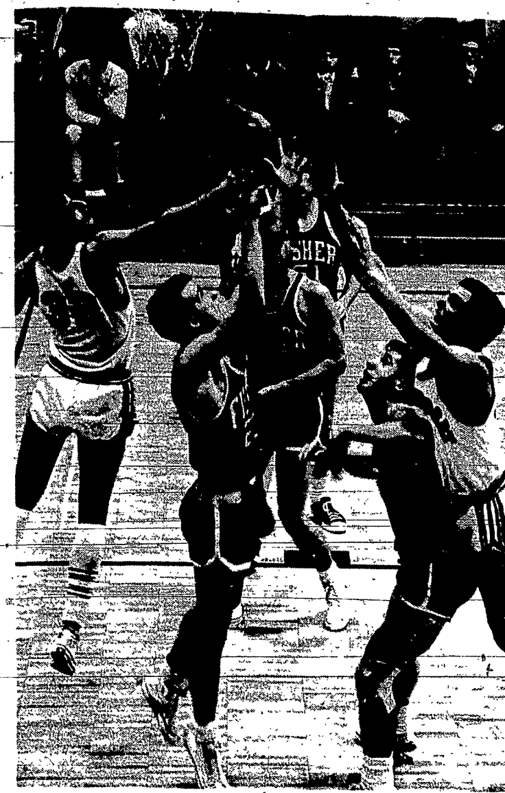
Action on the court at Fisher.