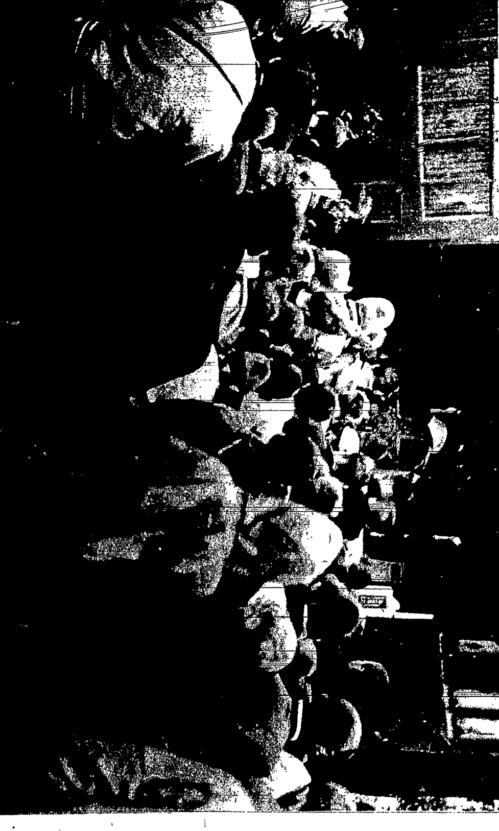
Scouts of the Sullivan Trail Council, B.S.A., kneel during the first Field Mass held at Camp Seneca, on Seneca Lake.