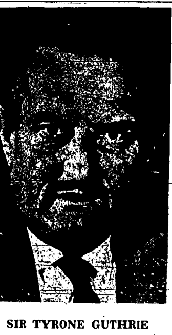
SIR TYRONE GUTHRIE

A list of Guthrie's contributions to the theater might serve as an outline for a historical anthology of Western theater literature. His Broadway credits, alone, include widely acclaimed productions of "Troilus and Cressida," "Tamburlaine," "Candide," "Six Characters in Search of an Author," "The Makropoulos Secret," "The Tenth Man," "Gideon," "H.M.S. Pinafore," and "The Pirates of Penzance." The lecture is open to the Rochester community as well as to Nazareth students. Admission: $1.00.