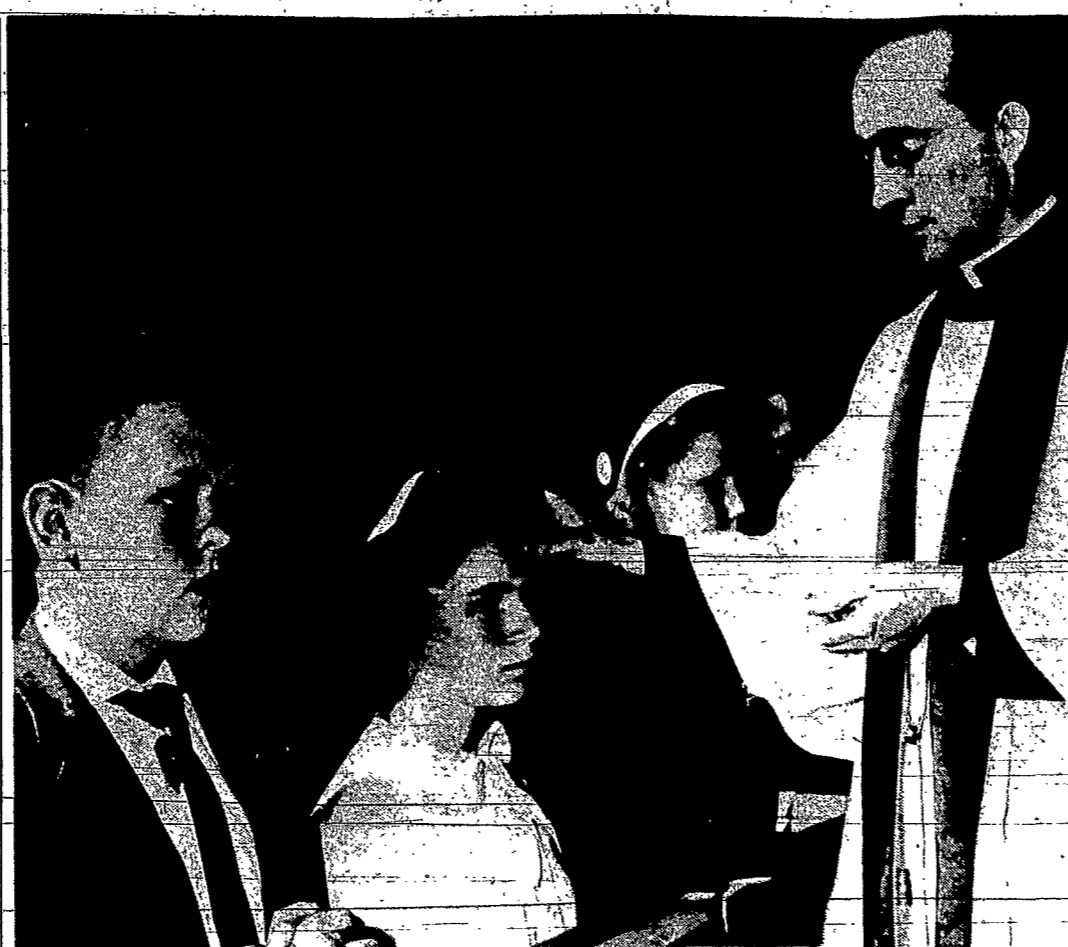
"Remember, you are dust..." Lent begins Wednesday, Feb. 8, with annual reminder of our mortality. Parish bulletins should be consulted for time of Lenten services. Catholics will observe Lenten Fridays as "old-fashioned" Fridays... no meat, according to directive of U.S. Catholic bishops.