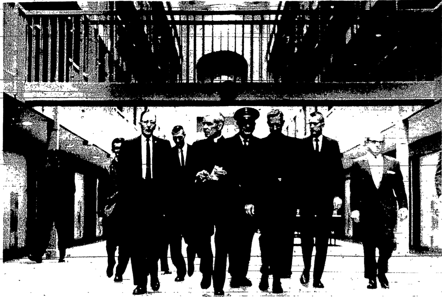
Bishop Sheen tours Elmira Reformatory with prison officials.