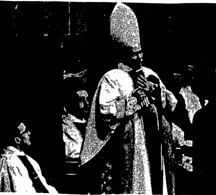
'I hope you will love me as I love you.'

This is the text of Bishop Sheen's sermon at his installation Mass at Sacred Heart Cathedral Thursday, Dec. 15.