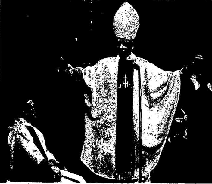
'Pray for me. Write to me.'

less you become like a child, you cannot enter the Kingdom of Heaven.