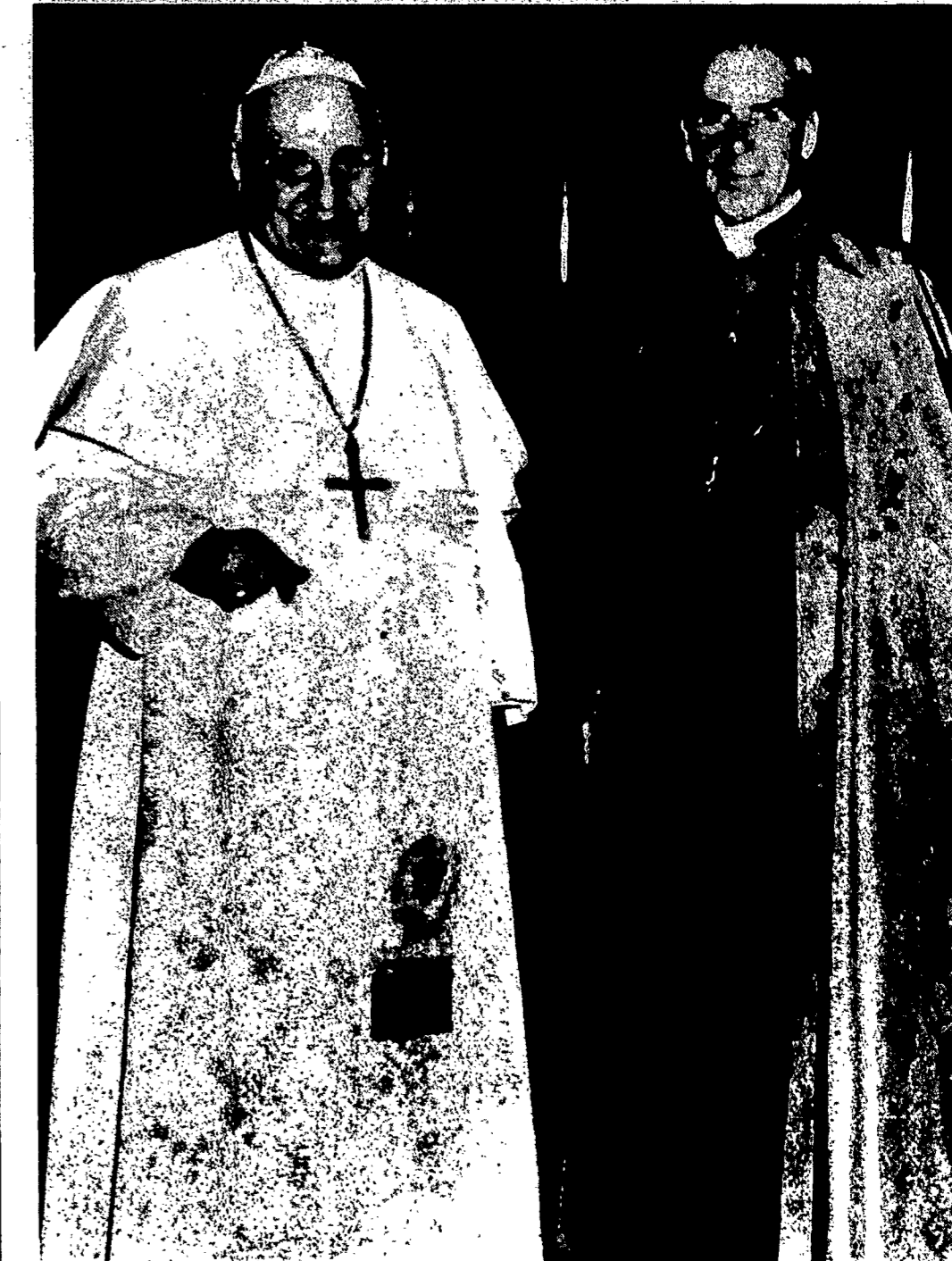
Pope John and a friend.