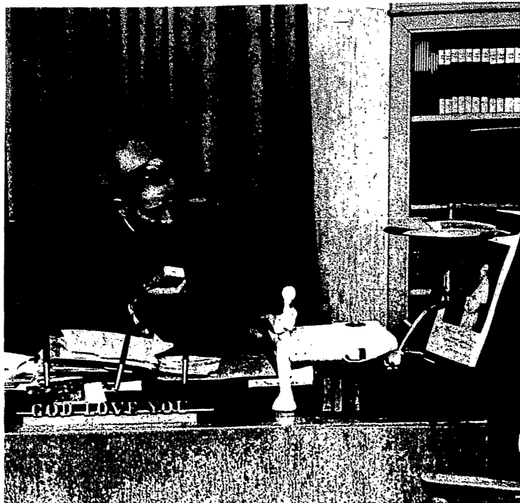
Dictating replies for a mountain of correspondence.