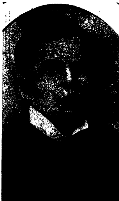
A portrait of many years ago.