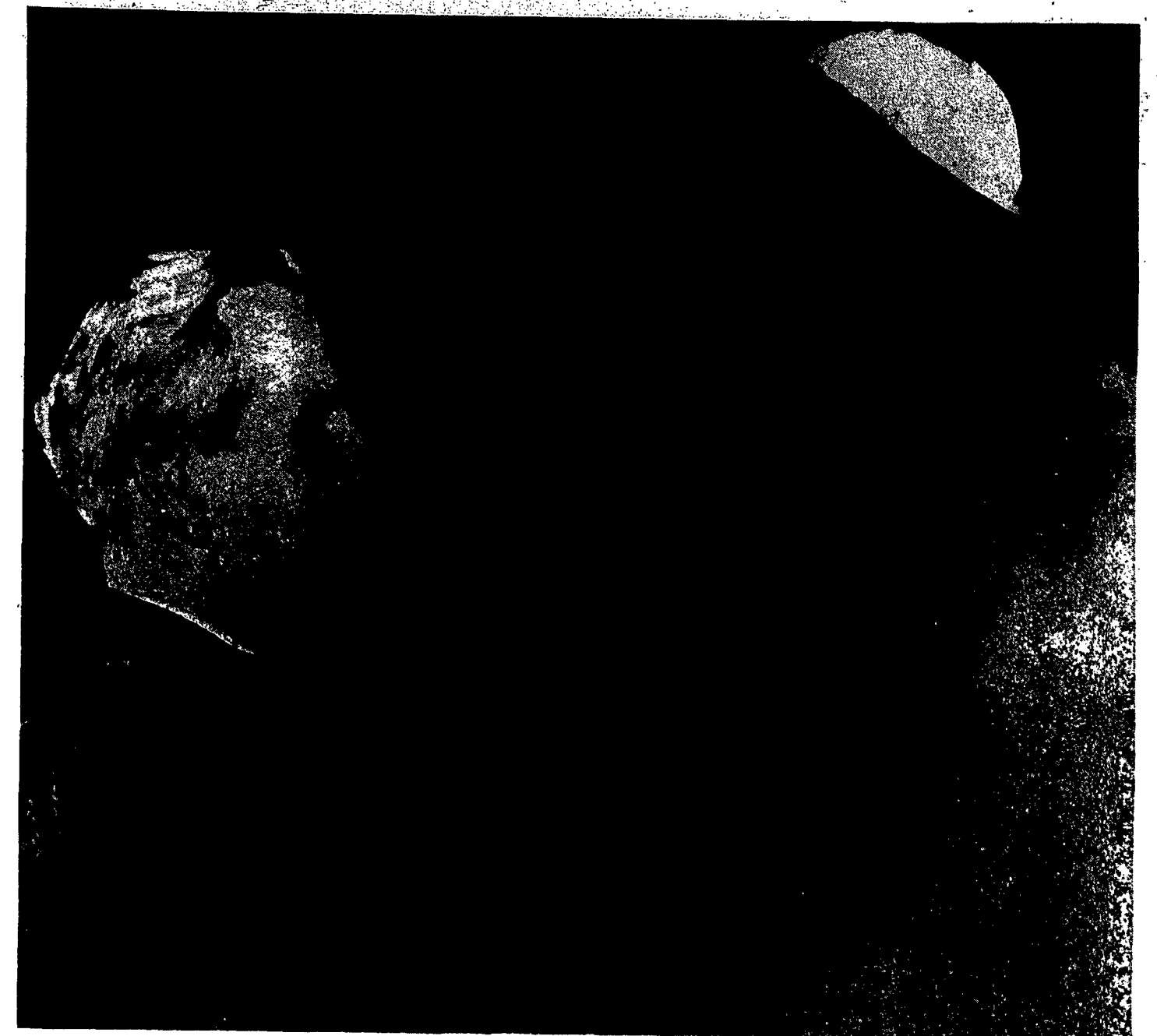
The Bishop of Rochester greets the Bishop of the Eternal City.

4A Catholic Courier Journal December 16, 1966