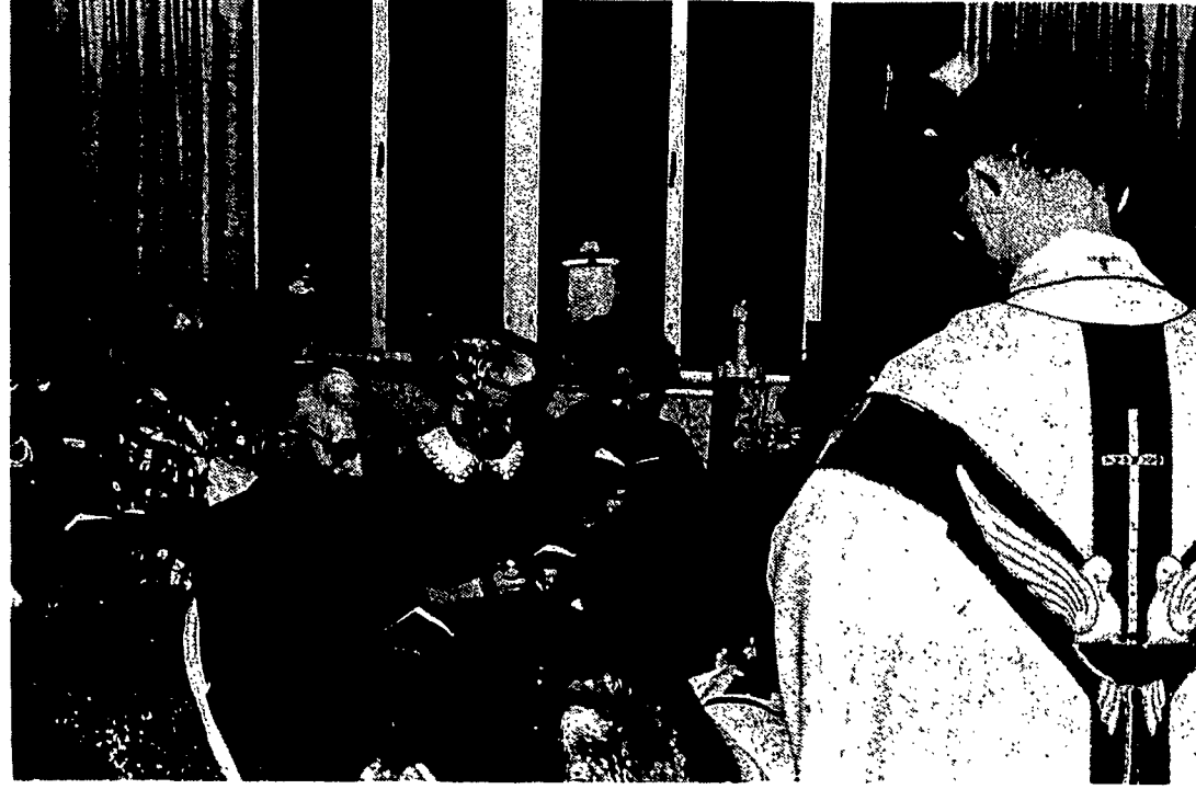
A glimpse of congregation—and of the U of R across the River.