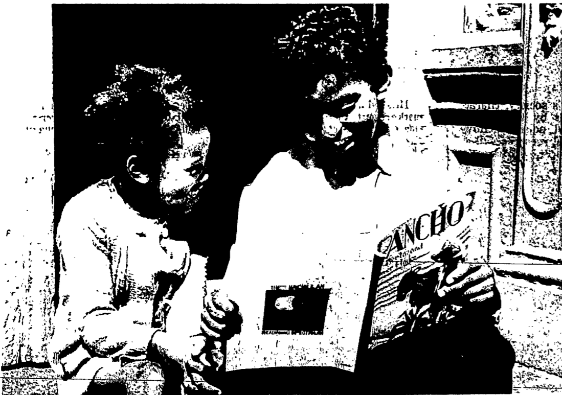
A storybook on the doorstep in the sunshine ... no easier way to make a child's heart happy.