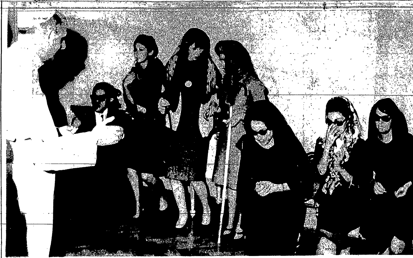
Blind Americans Castel Gandolfo — (RNS) — Pope Paul VI blesses a group of blind Americans and their guides at a private audience. They were in Rome for a visit to the Italian Center for Blind People.