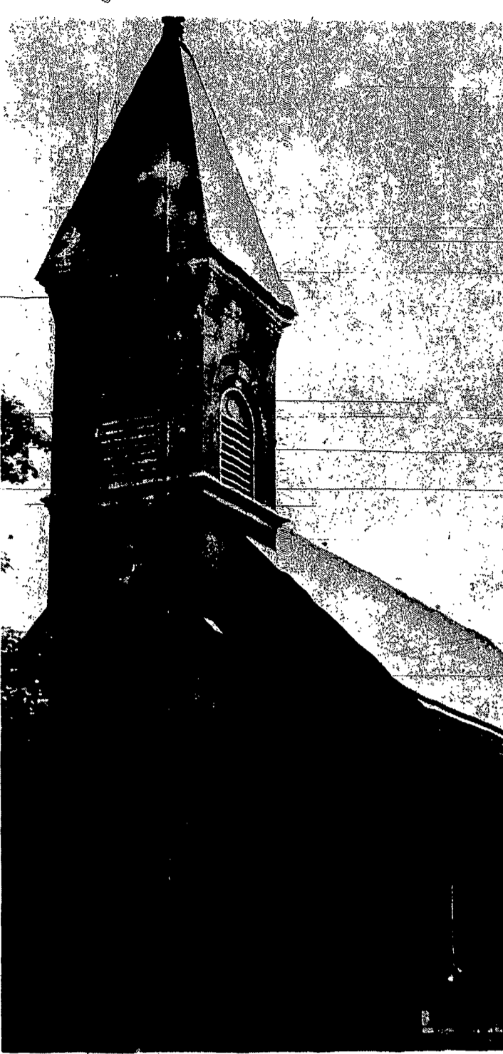
100TH BIRTHDAY for Fairport's Assumption parish will roll around this Sunday, Aug. 15, patronal feast of the parish. Present church structure was built in 1882.