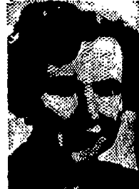
At Our House®