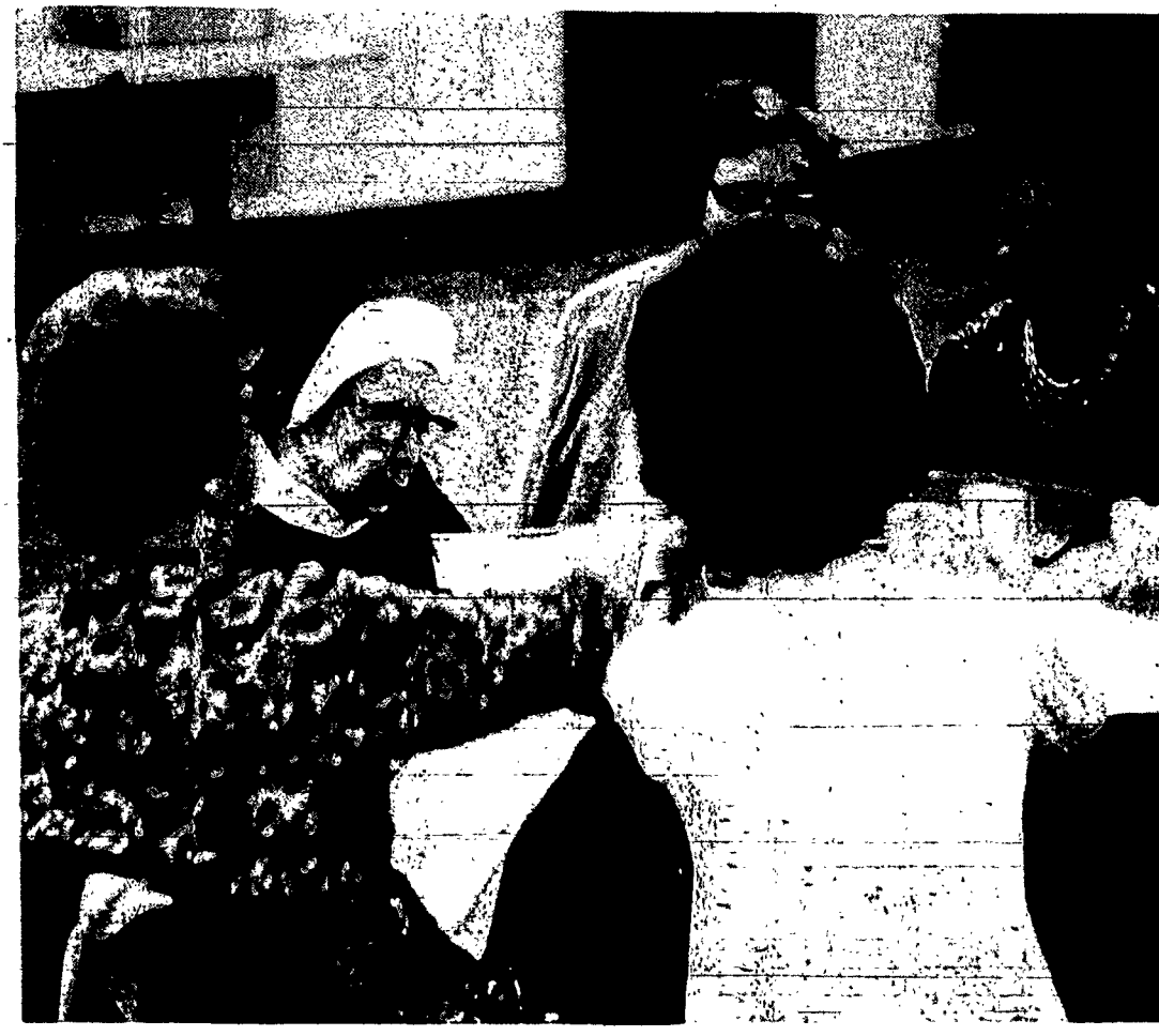
Everybody had a chance to talk