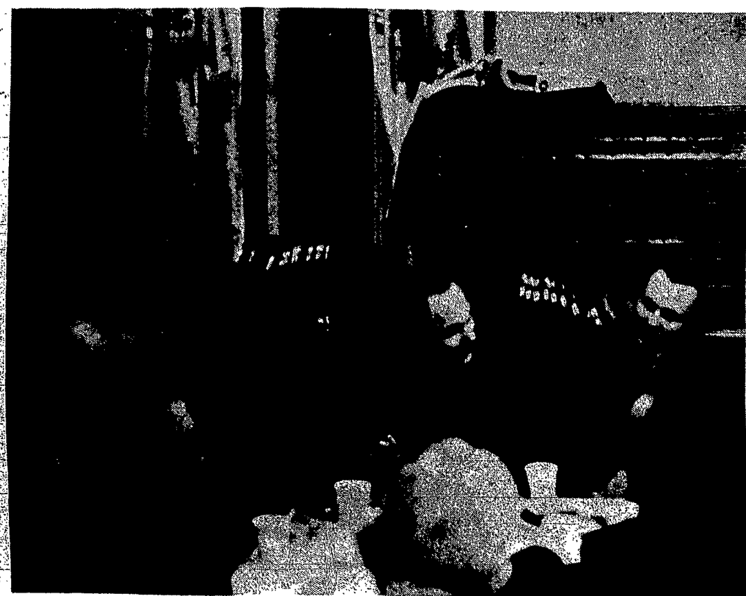
Clergy, laymen discuss theology