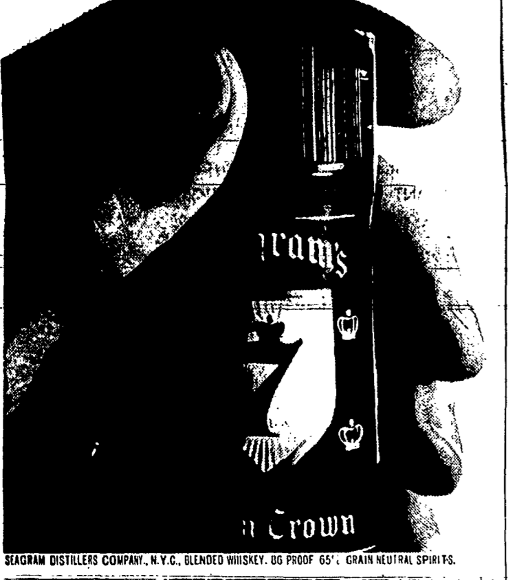
SEAGRAM DISTILLERS COMPANY, N.Y.C., BLENDED WHISKEY, 50 PROOF 65°, GRAIN NEUTRAL SPIRITS.

When it gets so jammed around the bar that you can hardly move - this is probably the bottleneck. (It's called The Sure One.)