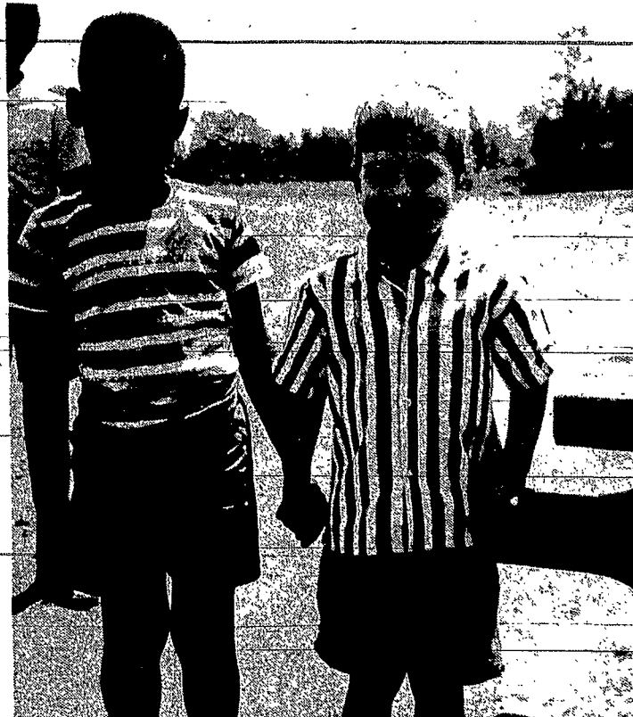
You can make a friend on a picnic.