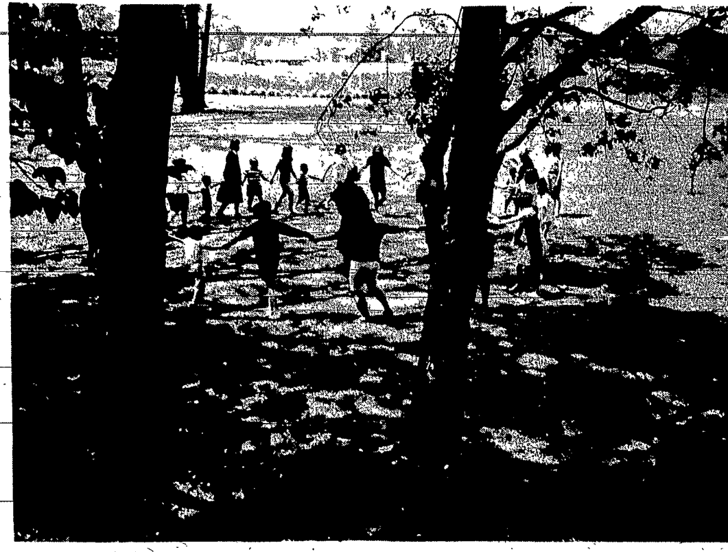
A game with the postulants and young professed Sisters in the garden.