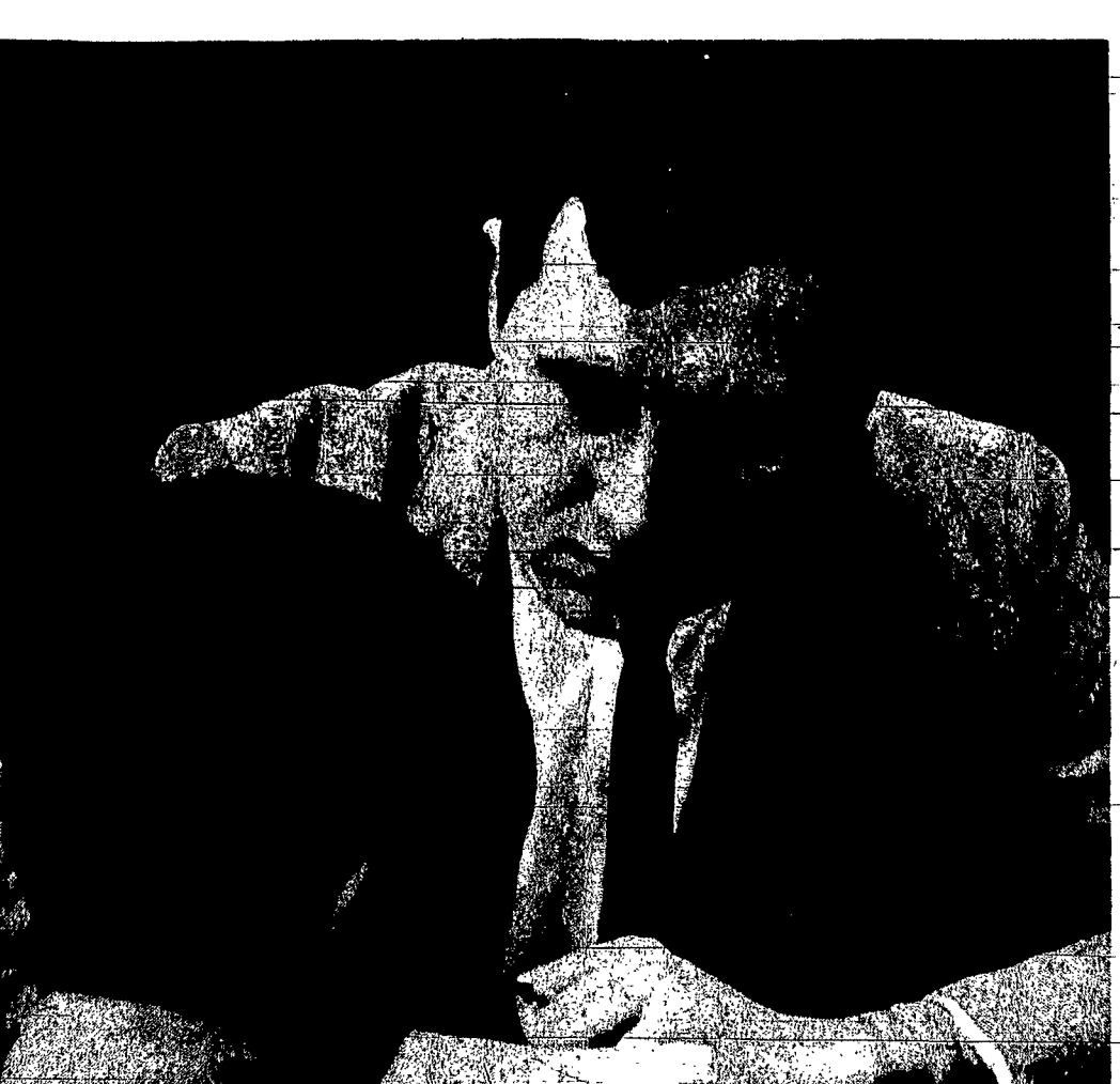
COUNSELING service is provided at Corpus Christi school by psychologist