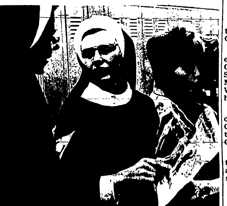
DISCUSSING TEACHING MATERIALS at last weekend's Educational Exhibit Day at Bishop Kearney High School are these teachers from Diocesan schools.