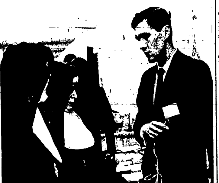
LATEST TAPE RECORDERS are demonstrated to these sisters by one of the more than 100 exhibitors, who displayed their educational wares at the Exhibit Day held last Friday and Saturday at Kearney High.