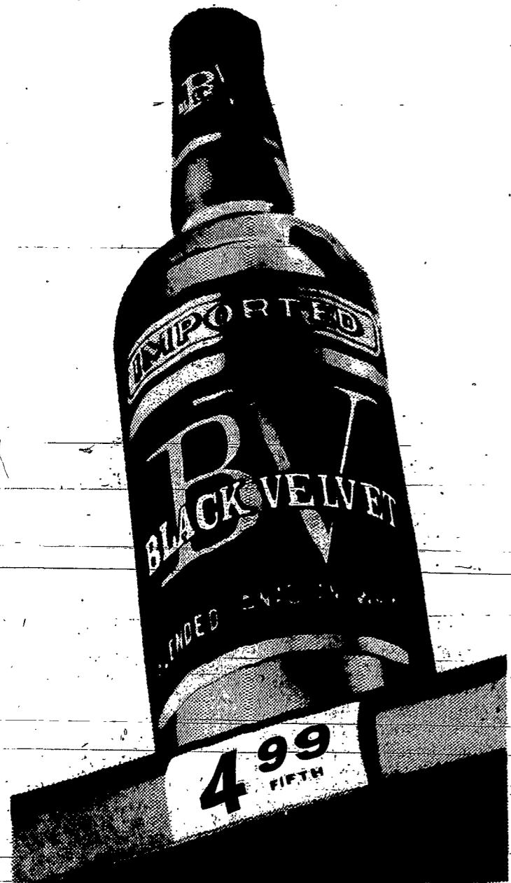
BLACK VELVET CANADIAN WHISKY, 80 PROOF IMPORTED BY HEUBLEIN, INC., HARTFORD, CONNECTICUT

Easy! It's imported in bulk to save you about $1.00 a bottle in tax and shipping. It's bottled here, but the whisky (like the taste) is all Canadian.