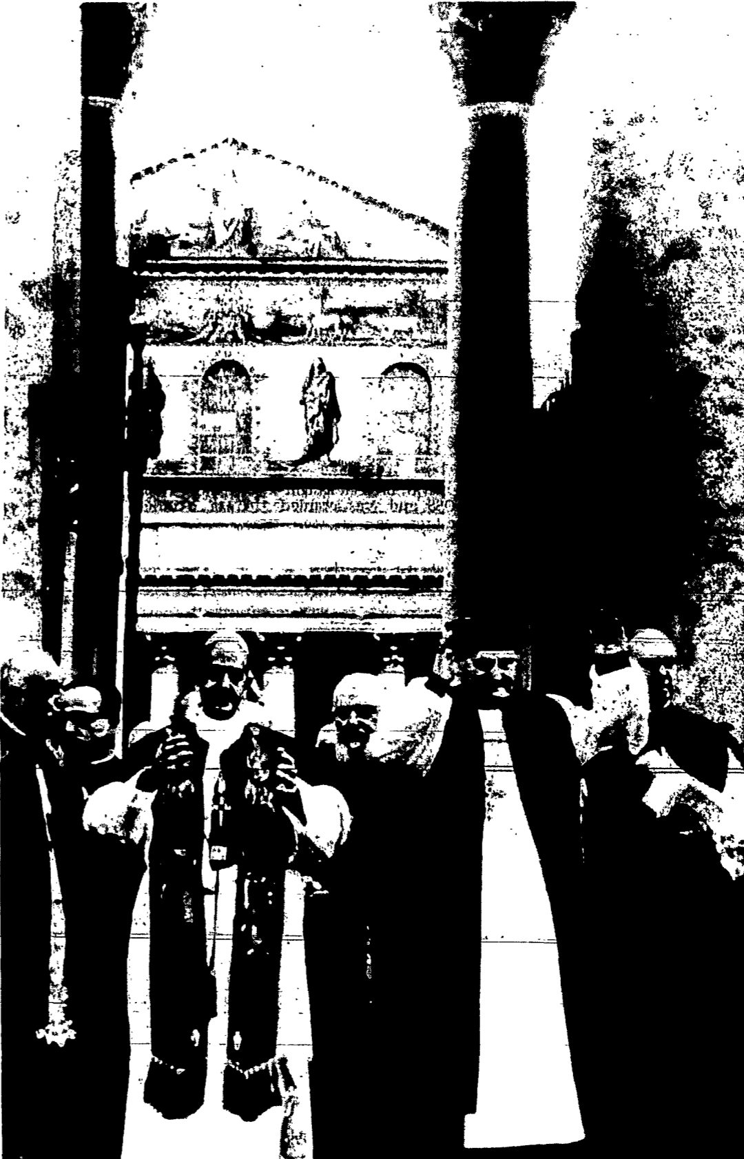
Pope and Primate respond to cheers of crowd as they leave St. Paul's Church in Rome after praying together and issuing statement establishing official dialogue between the Roman Catholic Church and the Church of England.