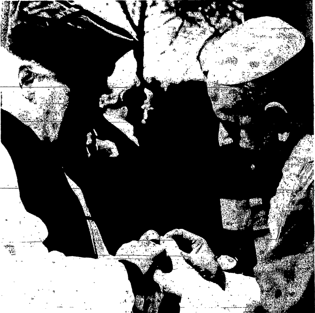
Pope Paul gives his papal ring to the Canterbury prelate as a farewell gift.