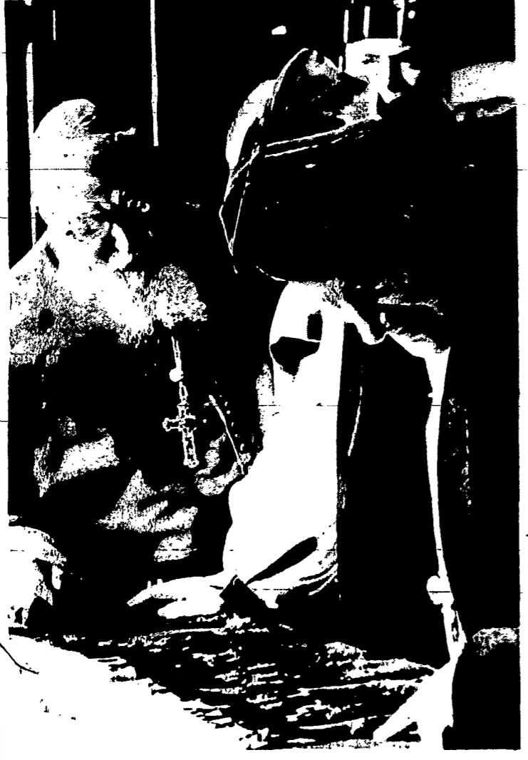
The Primate of England and Cardinal Eugene Tisserant view special exhibit at Vatican museum.

No formal decision on this matter has been made public, however, and it would be surprising if the English hierarchy, which is most directly concerned on the Catholic side, will be by-passed in this way.