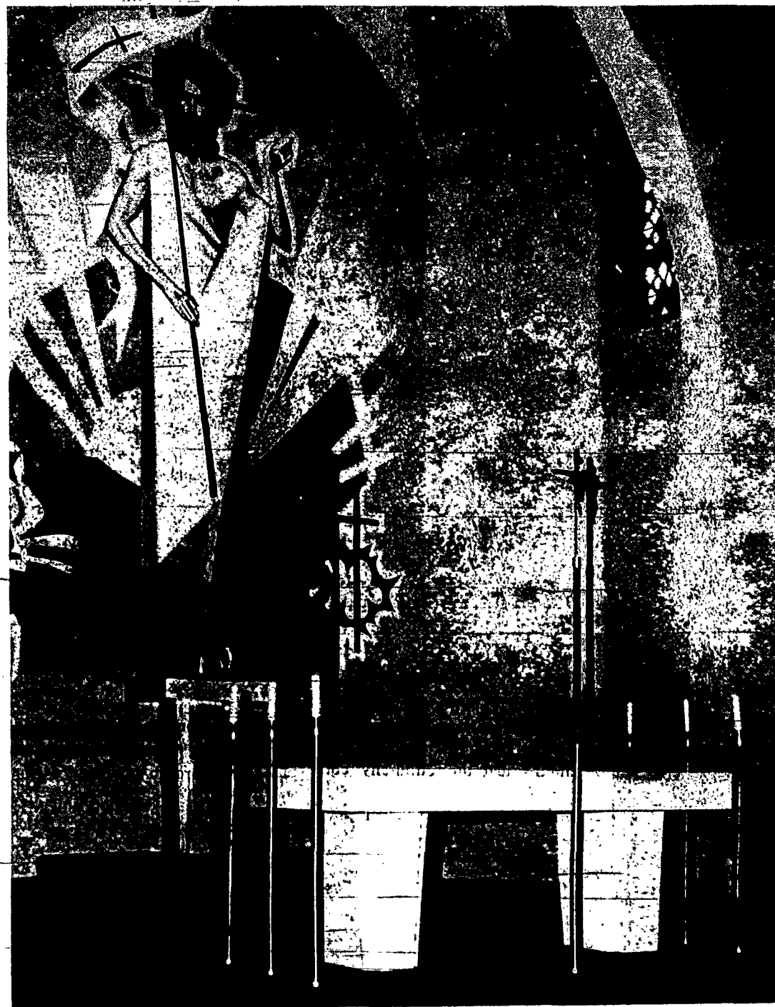
TABERNACLE in St. Francis de Sales new sanctuary is centered behind the main altar on a raised column. This is one of the possible options for tabernacle placement when the altar is facing the people.