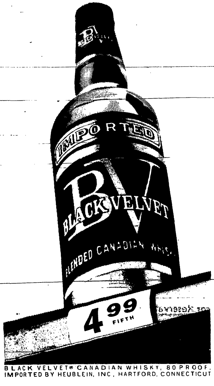
BLACK VELVET CANADIAN WHISKY, 80 PROOF. IMPORTED BY HEUBLEIN, INC., HARTFORD, CONNECTICUT

Easy! It's imported in bulk to save you about $1.00 a bottle in tax and shipping. It's bottled here, but the whisky (like the taste) is all Canadian.