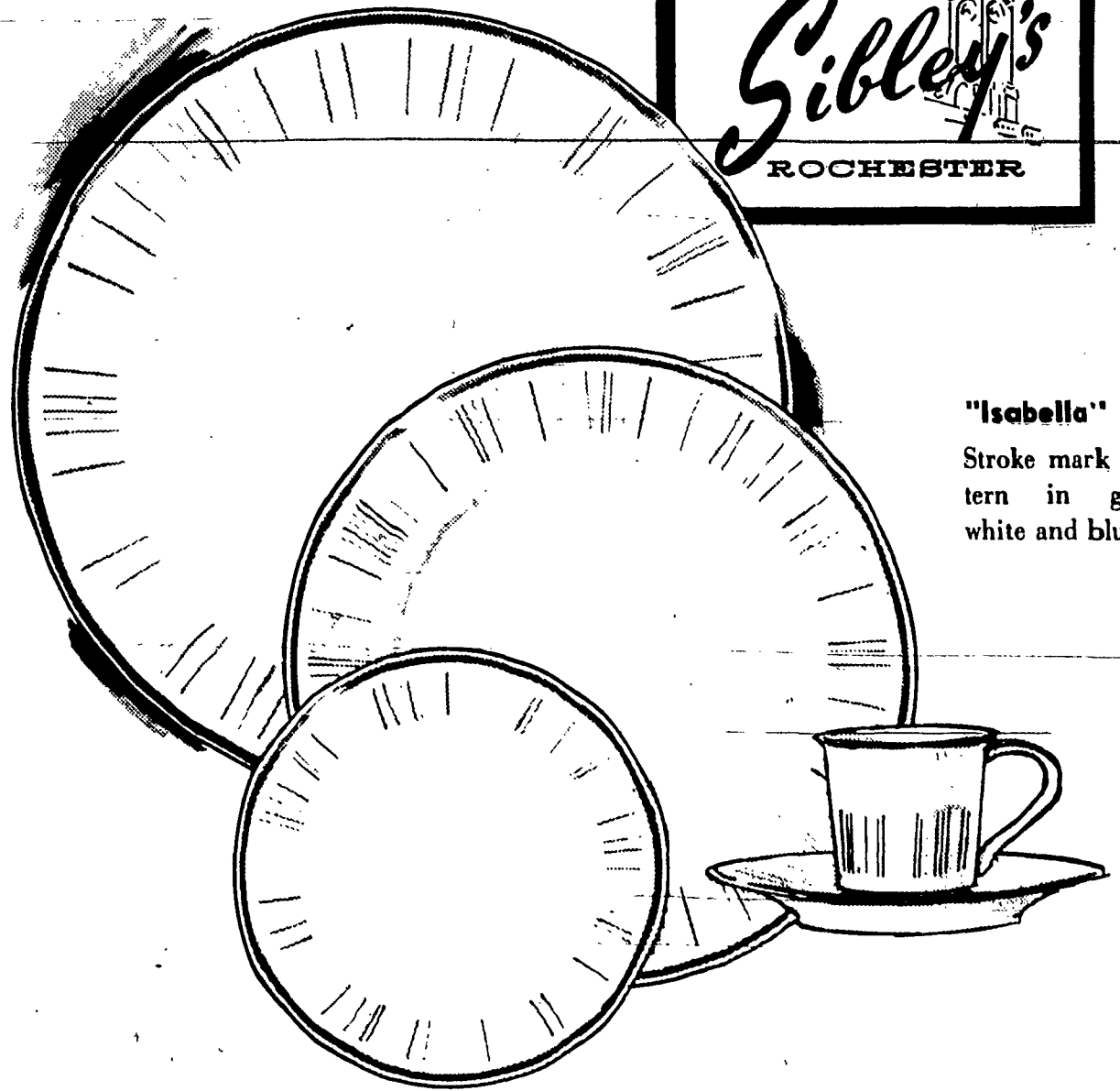
"Isabella" Stroke mark pattern in grey, white and blue.