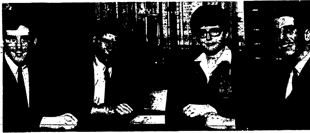
WINNING SMILE—is apparent on faces of Kearney High's debate quartet, after squad won the recent Victor Invitational meet with an 8-0 score.