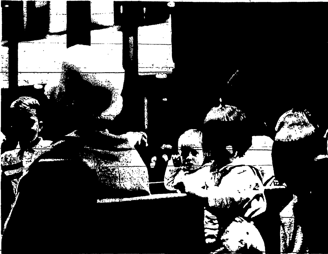
YOUNGEST PARTICIPANTS at the dedication of Our Lady of Lourdes were in the sound-proofed "crying room." They turn to cast an inquiring glance at the Courier-Journal photographer. The rest of the church was filled with other parishioners on hand for the dedication, which took place on the patronal feast (Feb. 11) of Our Lady of Lourdes.