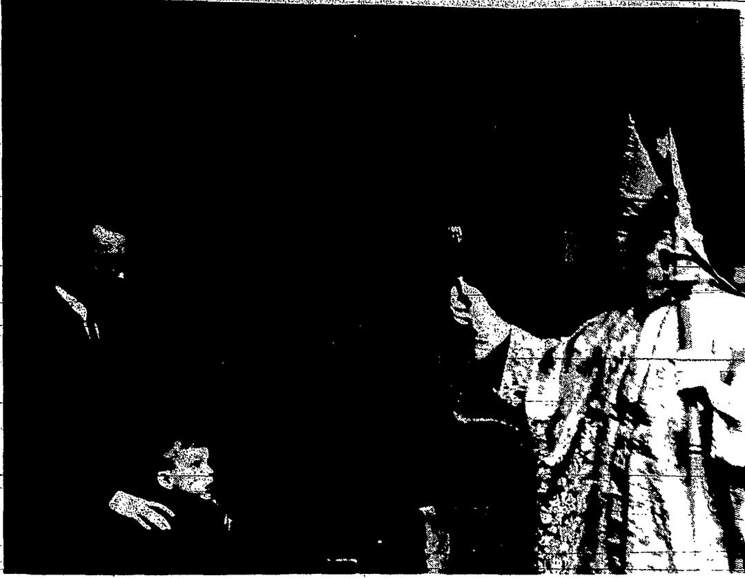
A SPECIAL BLESSING — As Bishop Kearney was proceeding around Our Lady of Lourdes church in the dedication rite, he passed this small spectator standing with his father. The Bishop paused to give him a special sprinkle of holy water.