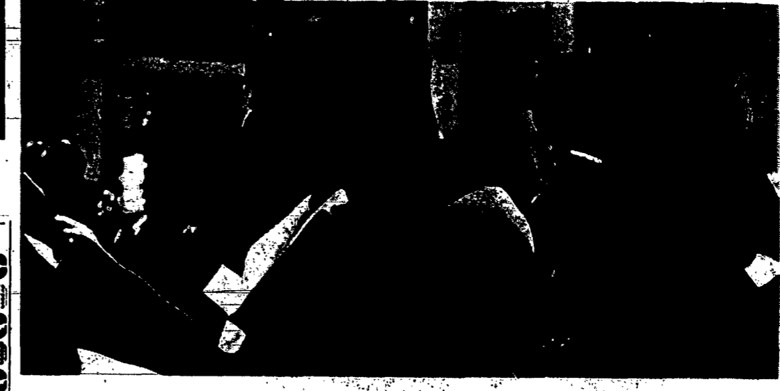
Cathedral was filled beyond seating capacity for Sunday's organ dedication Mass. All joined in singing music composed for the occasion.