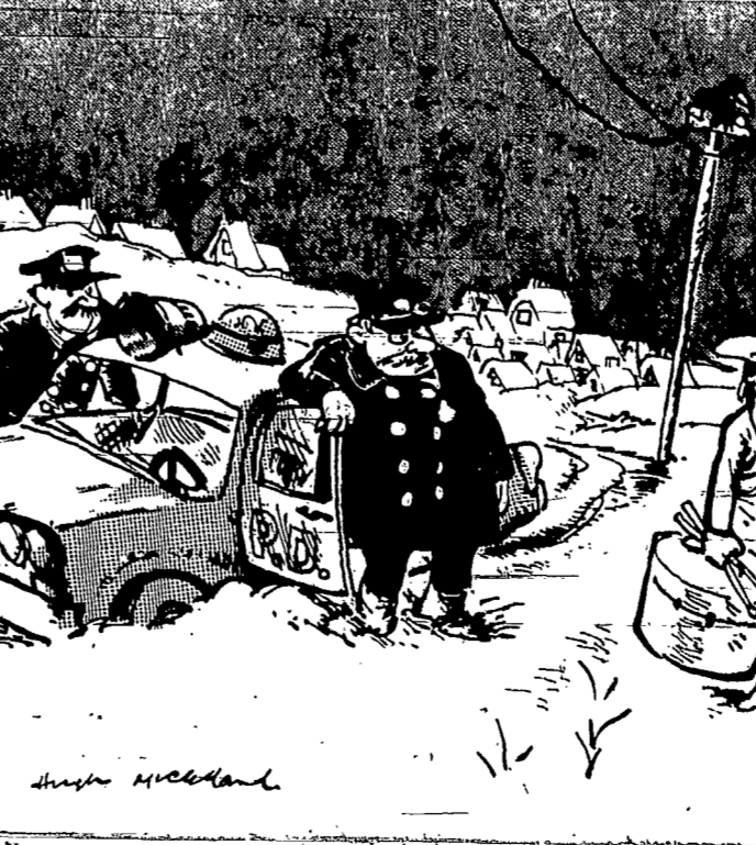
"Why is it that the smaller the town the bigger the rush to chase us out?"